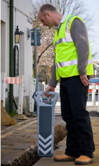
A cable avoidance tool in use