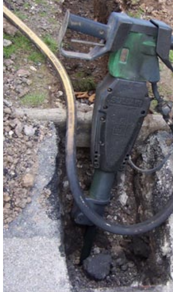
This charred breaker has struck an 11KV cable in a shallow trench